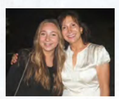
216 | TUTTO ARABI - www.tuttoarabi.com